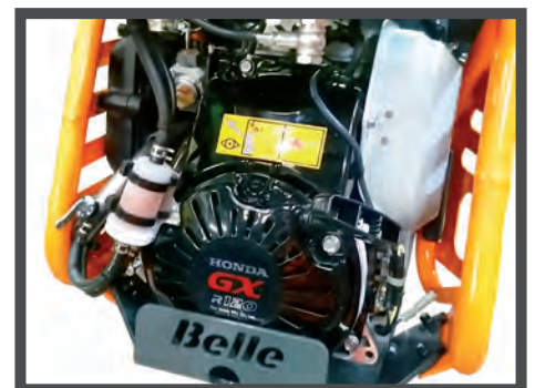
HONDA GXR120 ENGINE