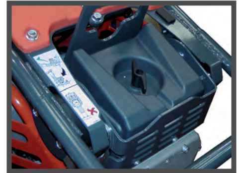
TRIPLE FILTER AIR CLEANER